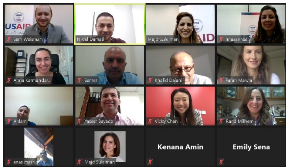
Seven local MEL organizations shortlisted to tier-one Rapid Procurement Mechanism during the announcement meeting

On November 3 rd , the USAID Monitoring, Evaluation, and Learning Activity held a virtual meeting to announce the selection of 12 Jordanian organizations to join the Activity’s Accelerator Program! These organizations applied to have the opportunity to provide USAID Jordan and its partners with a wide spectrum of MEL services. At the same time, these organizations will receive technical and institutional support from the USAID Monitoring, Evaluation, and Learning Activity. These Local MEL Organizations (LMOs) will build their network and connect with each other through the MEL Community of Practice.